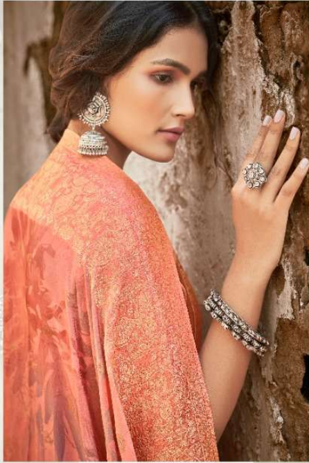
Fabric choice is presented in party in the exquisite linen and cream coloured dress. Its charming embroidery and beautiful design build a attractive look, while the new fabric promises pure comfort.