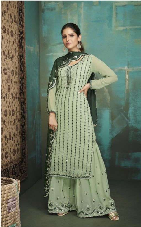
111 These impeccable shades of cool hold a prestige only revealed on closer inspection buy now - wear forever!