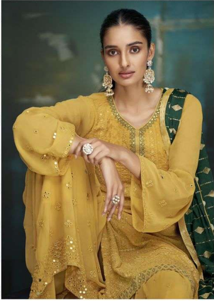
113 | Mustard color dress and contrast green scarf, embroidery work from above enhances her adornment.