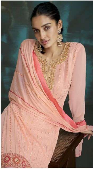
112 | Attractive embroidery work with beautiful contrast color makes the suit more attractive.