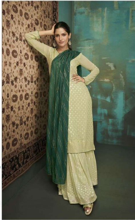
114 Beautiful color with great design sequence work that makes everyone look at you.