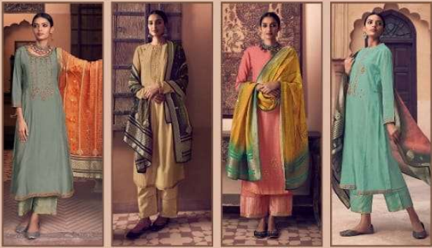
KT-44 KT-45 KT-46 KT-47