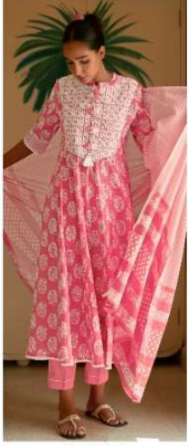
K - 202