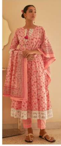
K - 204