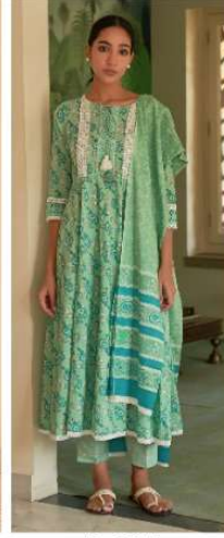
K - 205