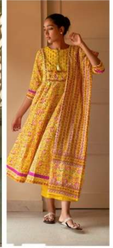
K - 206