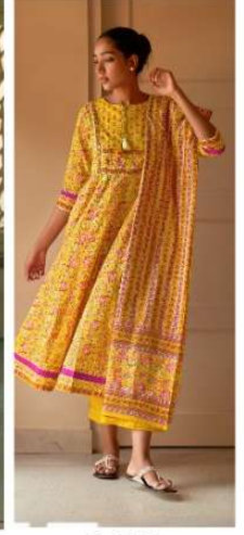
K - 206