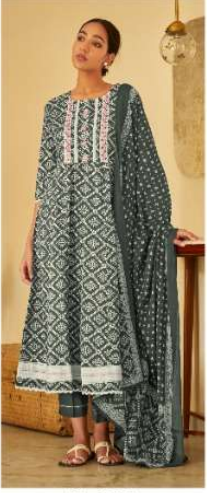
K - 201