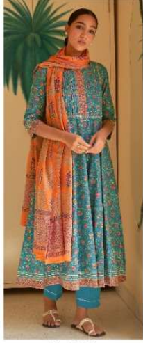
K - 203