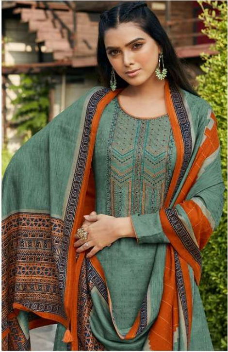
Basic styles with luxurious soft fabrics are 22001 highlighted by refined and feminine details : FASHION :