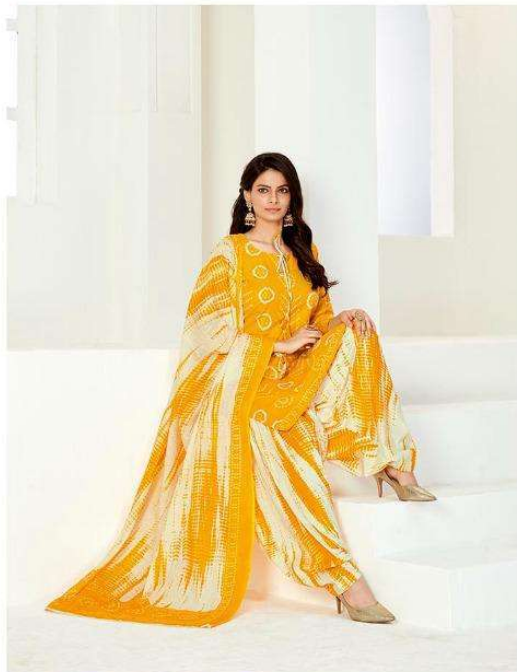
| Simplicity is the ultimate form of sophistication |