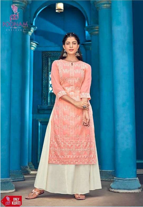
NO. 201 Merge your STYLE with ELEGANCE