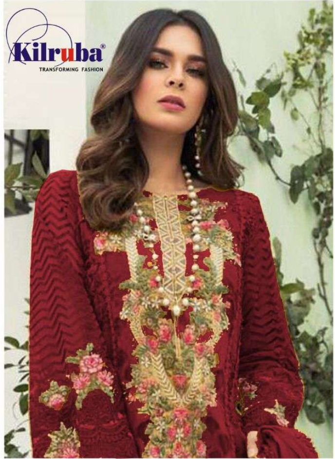
K - 56 N