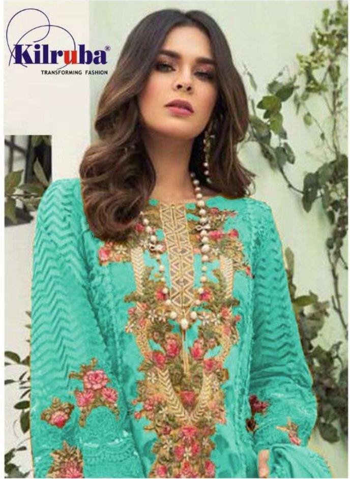
K - 56 K