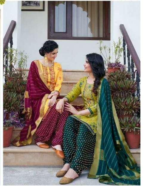
A ROUND UP OF THE HOTTEST TRENDS THIS SPRING SEASONS YOU THE CHICEST WAYS TO WEAR PASTELS