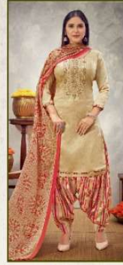
S 839 005