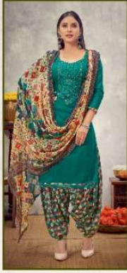
S 839 003