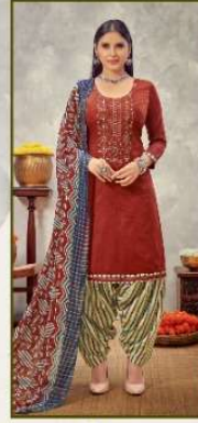
S 839 004