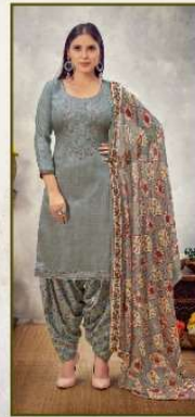
S 839 009