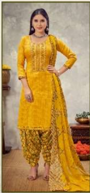
S 839 007