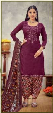
S 839 006

Surat-E-Patiyala THE QUALITY OF PATIYALA