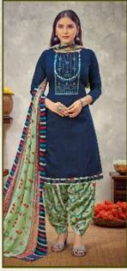
S 839 002