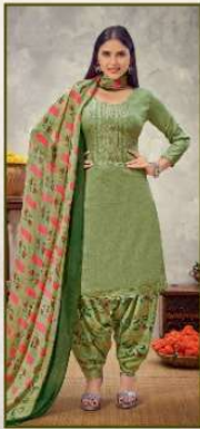
S 839 008