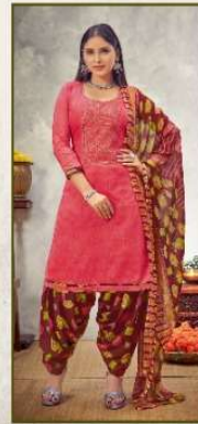
S 839 010