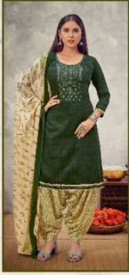
S 839 001