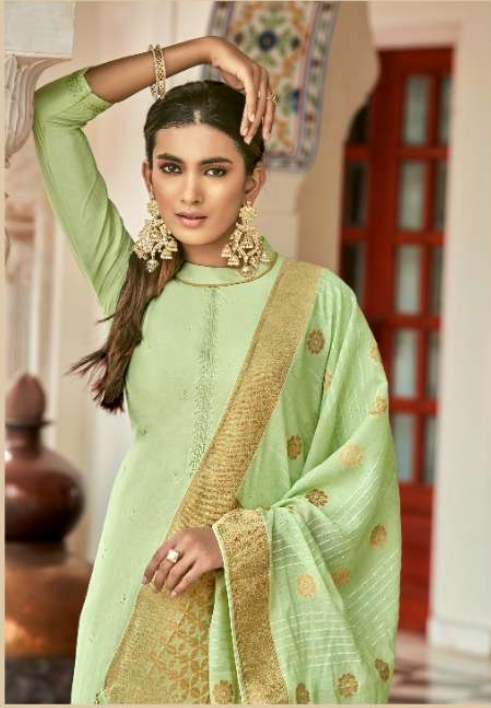
=== D.No.1004 ===