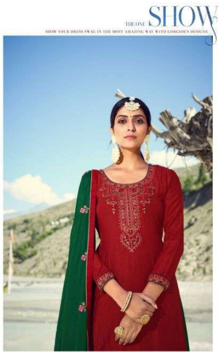
GET THE LOOK - 2301