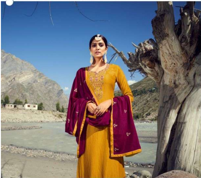
GET THE LOOK - 2306