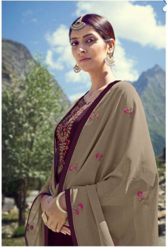
GET THE LOOK - 2903