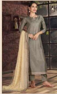
D.No : 72004