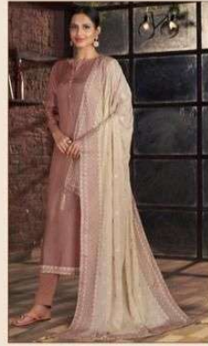
D.No : 72005