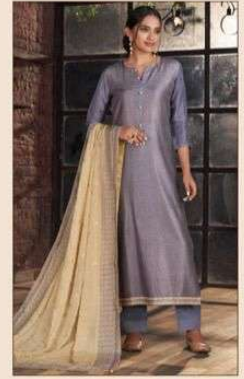
D.No : 72006