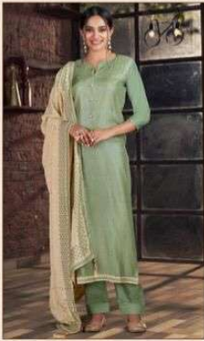
D.No : 72003