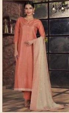
D.No : 72002