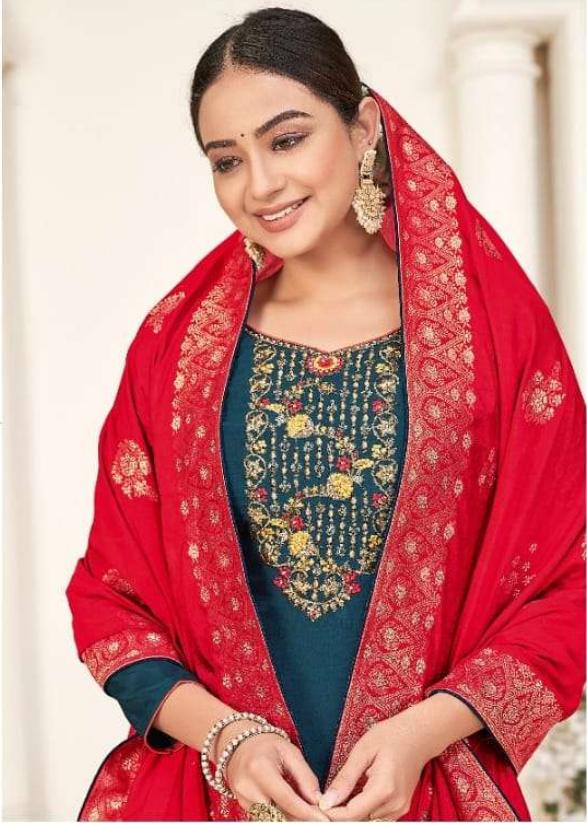
SEIZE ALL ATTENTION WITH THIS SPARKLING VIBRANT COLOR ATTRACTIVE DRESS WITH NATURAL FLOWER