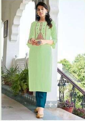
STYLE / 3221