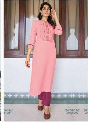
STYLE / 3228