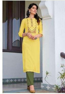
STYLE / 3227