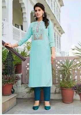
STYLE / 3222