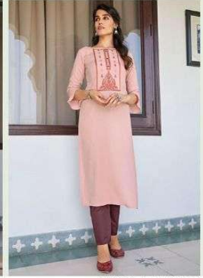
STYLE / 3226