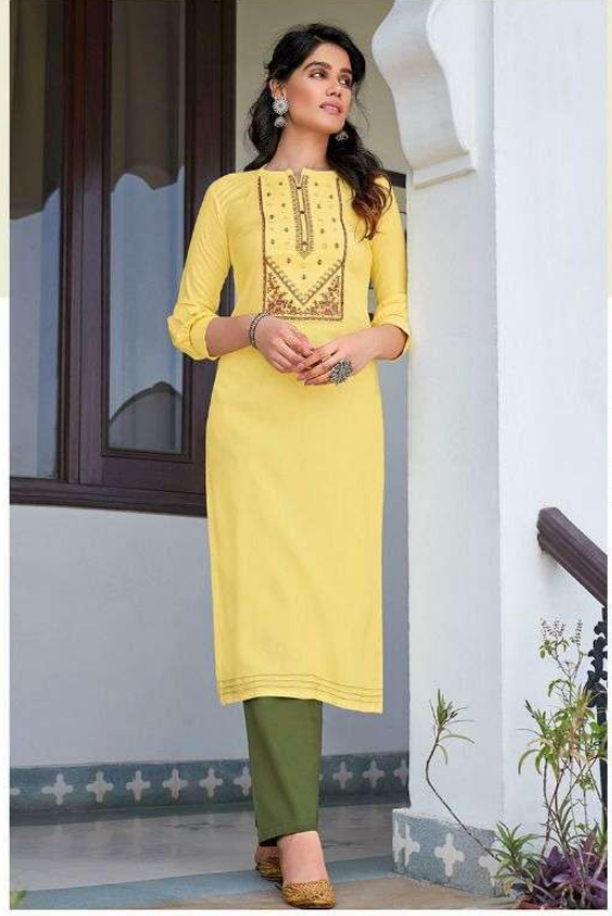
STYLE / 3227 — Rebel in a whole new level of elegance with a touch of exquisite sarees.