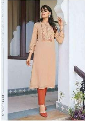
STYLE / 3223