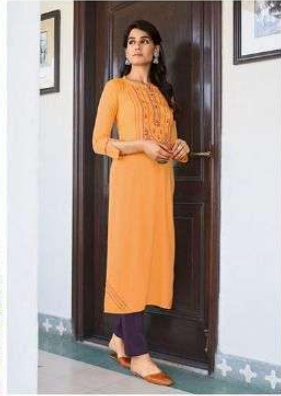
STYLE / 3224