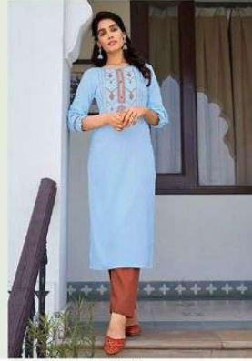
STYLE / 3225