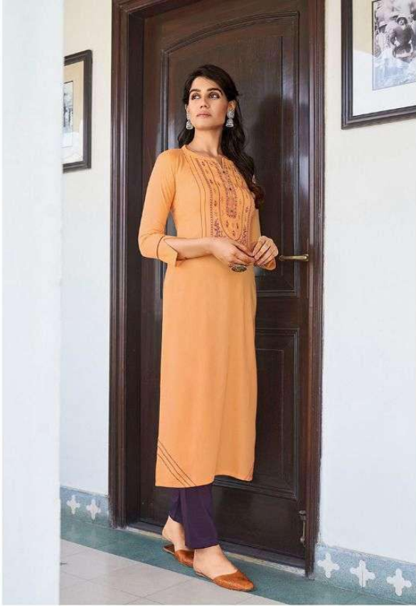
STYLE / 3224 ——— Dictate your style statement with the season's latest trends.