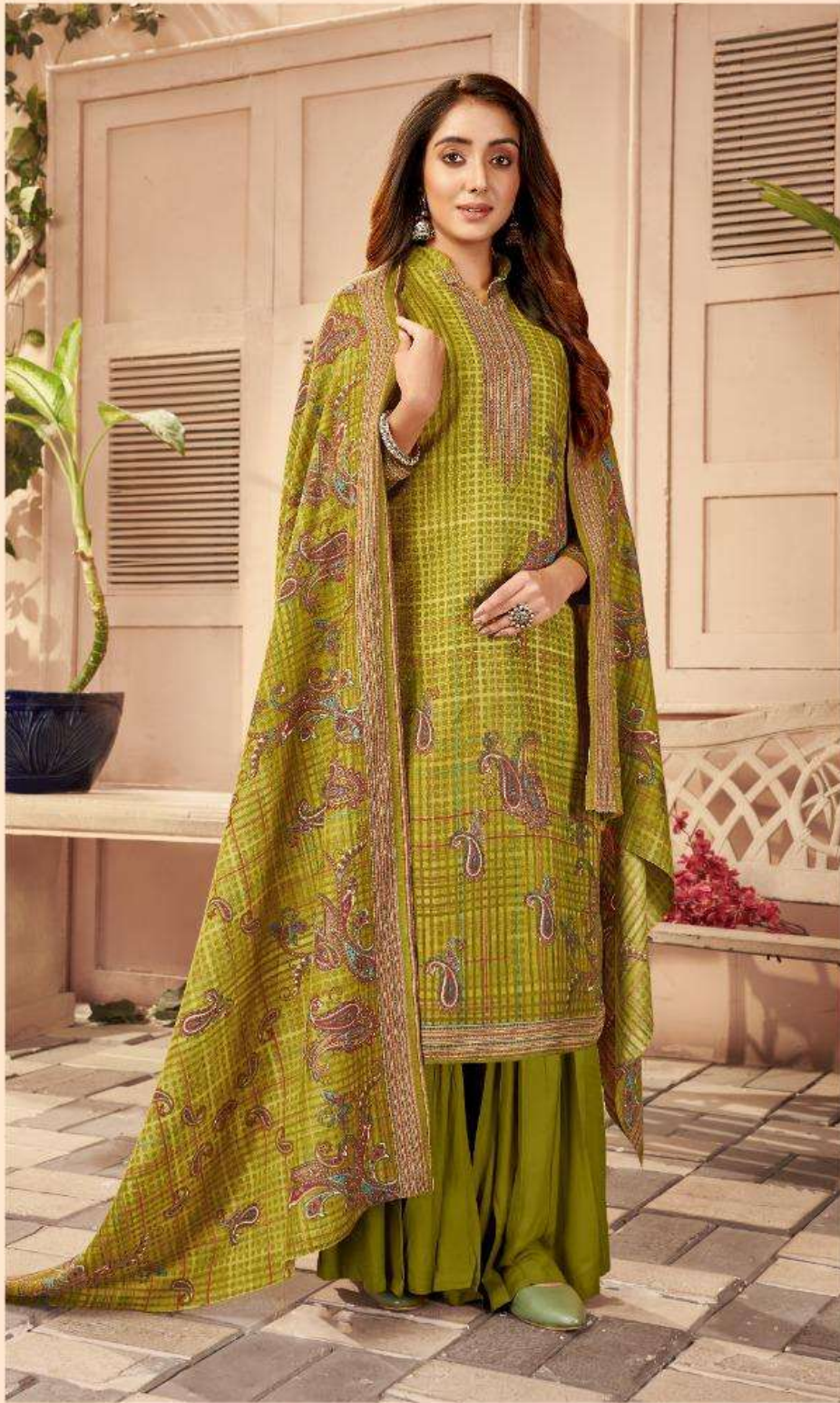
An ambience, filled with many refreshing expressions that are all set to build your confidence and unique appearance.