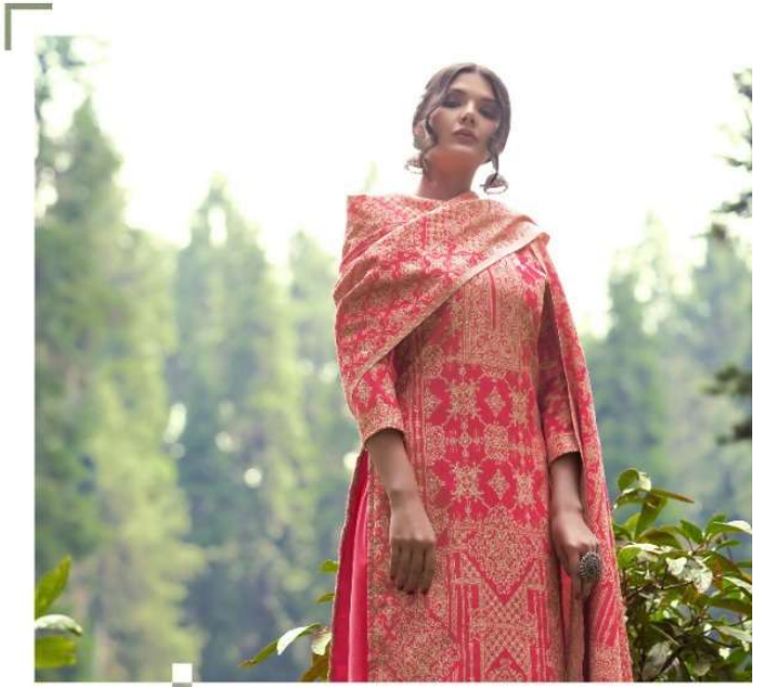
Non-quantile regression and bootstrap: The joint confidence interval for the