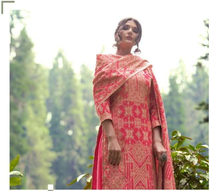
Noni, quare, elegantia, and beauty. The best, because you are. Elle.com