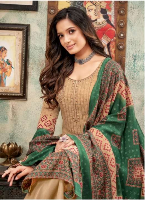
910-003 glamour is meal appeal she is having an her special day. she desires her appearance speaks all her emotion.