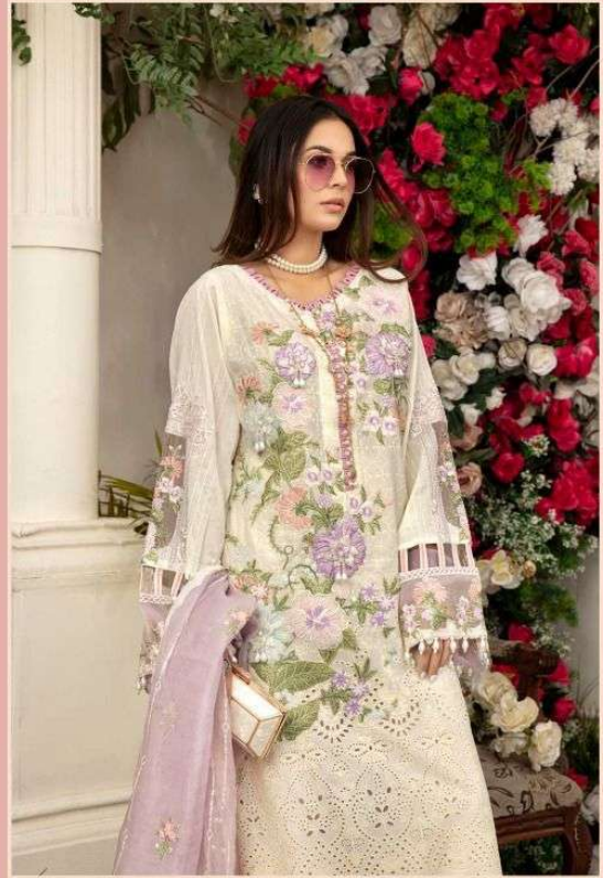
ADAN LIBAS Cotton Embroidered Collection