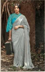
D. no. 11C 01