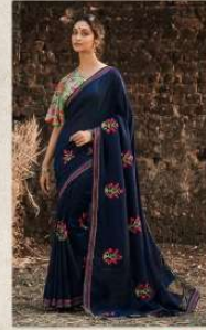
D. no. 11C 08