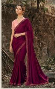
D. no. 11C 02