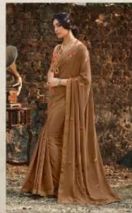
D. no. 11C 10