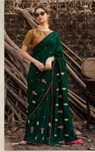
D. no. 11C 07