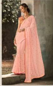
D. no. 11C 03