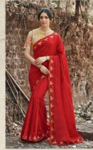
D. no. 11C 09