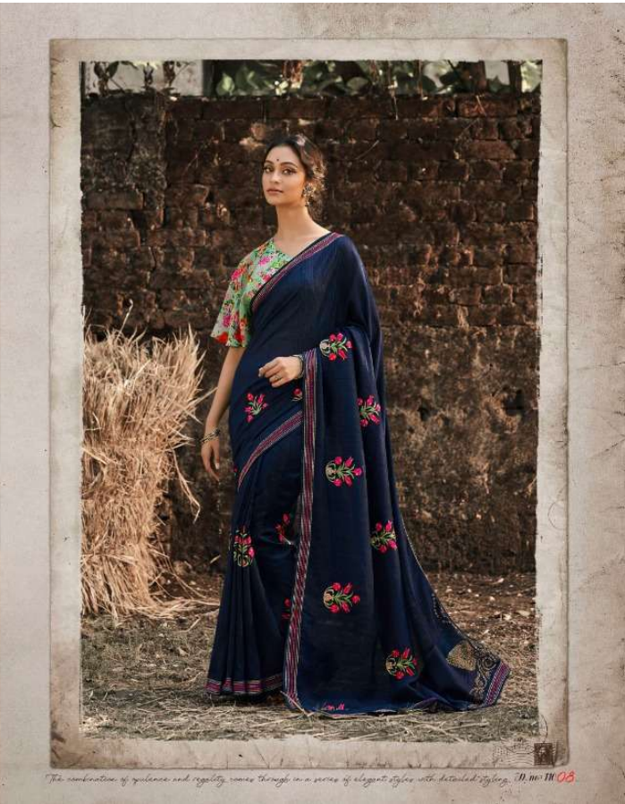
The combination of elegance and regality comes through in a series of elegant styles with detailed styling. PL. 03