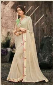
D. no. 11C 04