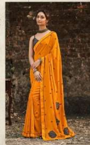
D. no. 11C 12