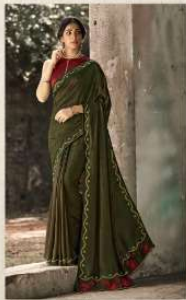
D. no. 11C 05