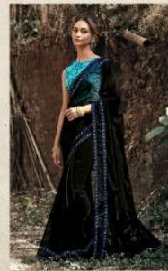
D. no. 11C 11