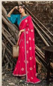
D. no. 11C 06