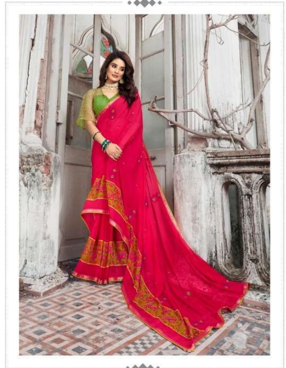
71006 Everyone begins a saree slightly differently and everyone's body looks different in it.