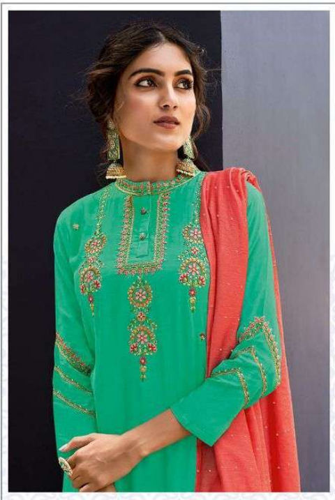
Classic style with luxurious soft fabrics are highlighted by refined and feminine details 3254