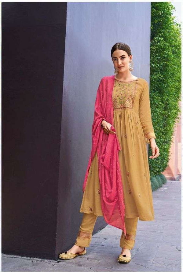
The vibrant palette in shades of red, pink, migrate come to life with highlights