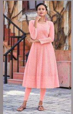
... 1004 ...