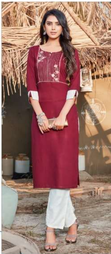
1 0 0 4