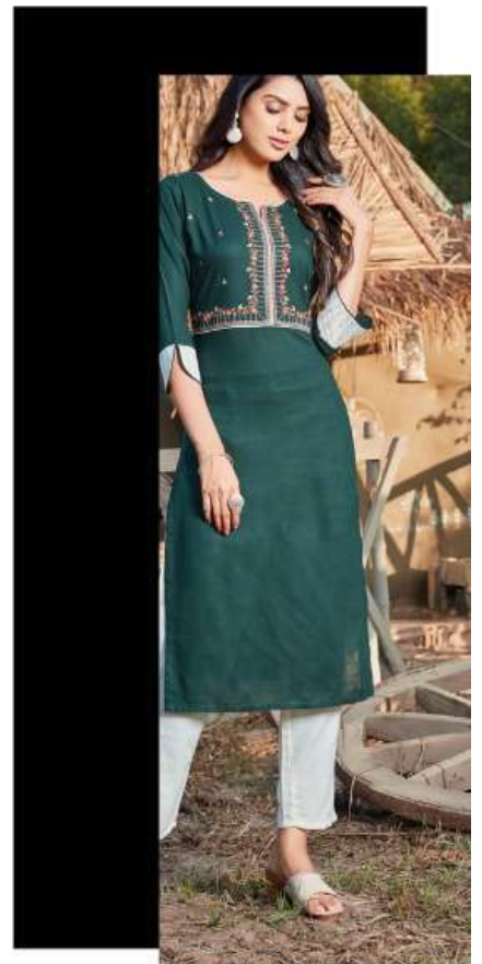
1 0 0 6