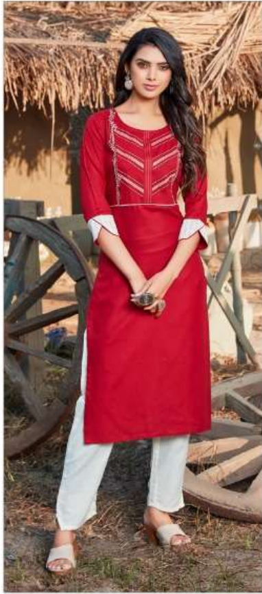
1 0 0 1