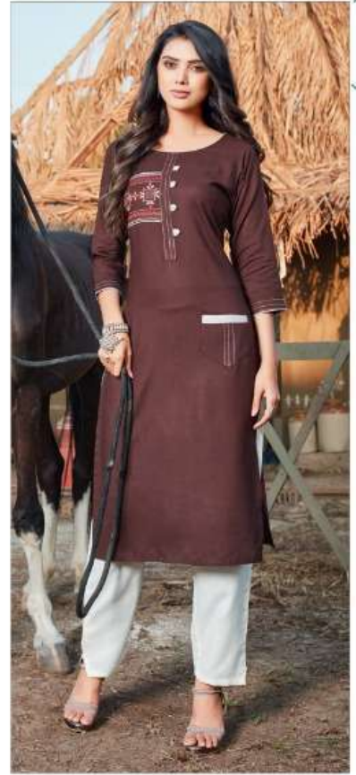
1 0 0 3