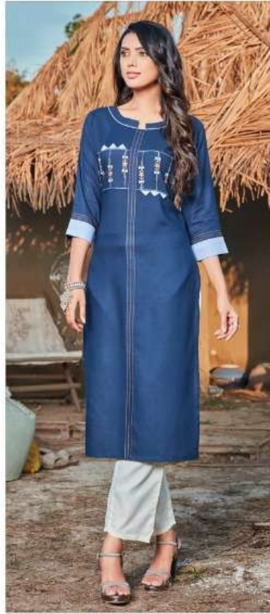
1 0 0 2