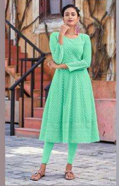
... 1002 ...