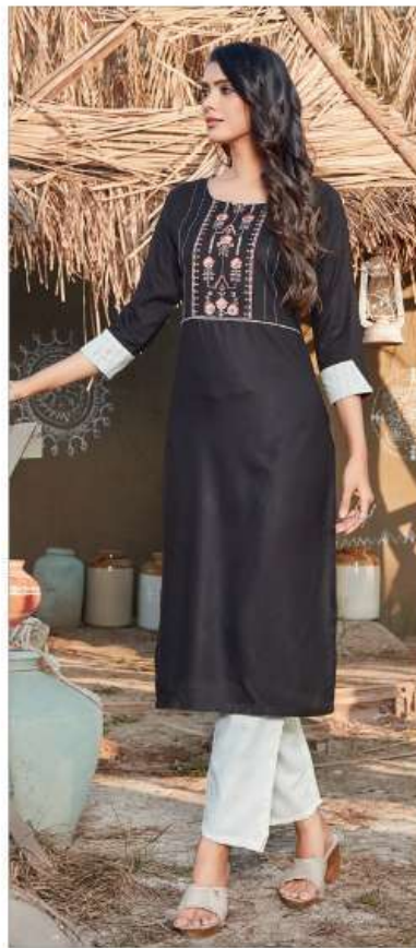
1 0 0 5