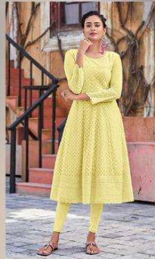
... 1003 ...