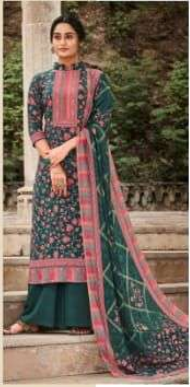
D NO. : 21005