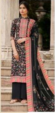
D NO. : 21002