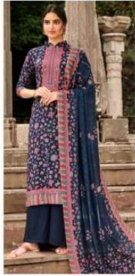
D NO. : 21006