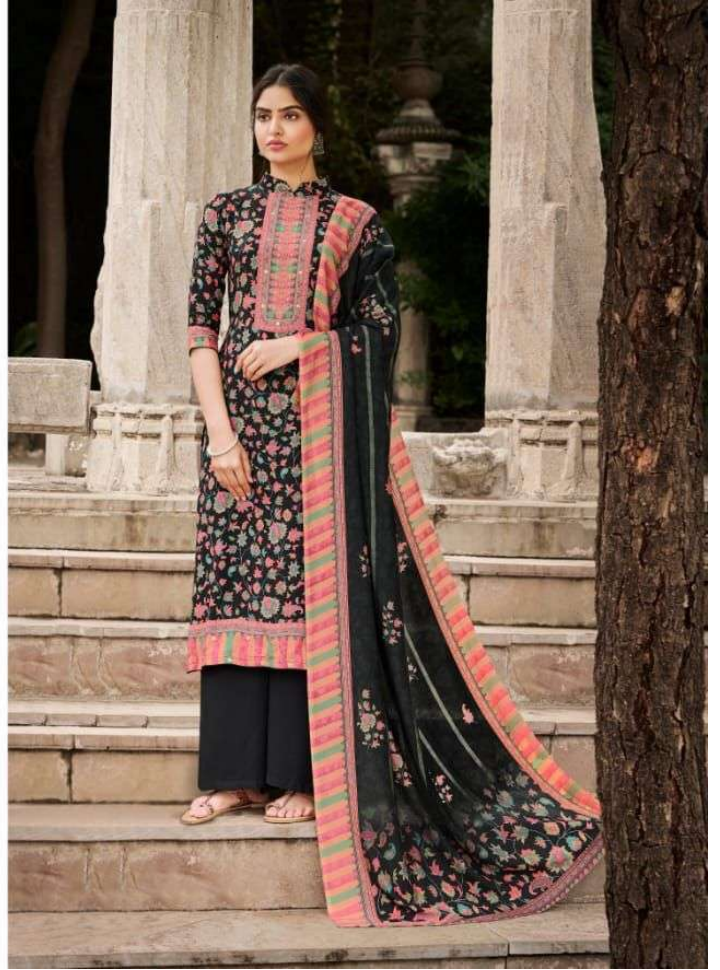
D NO. : 21002