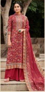
D NO. : 21001