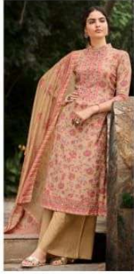
D NO. : 21003