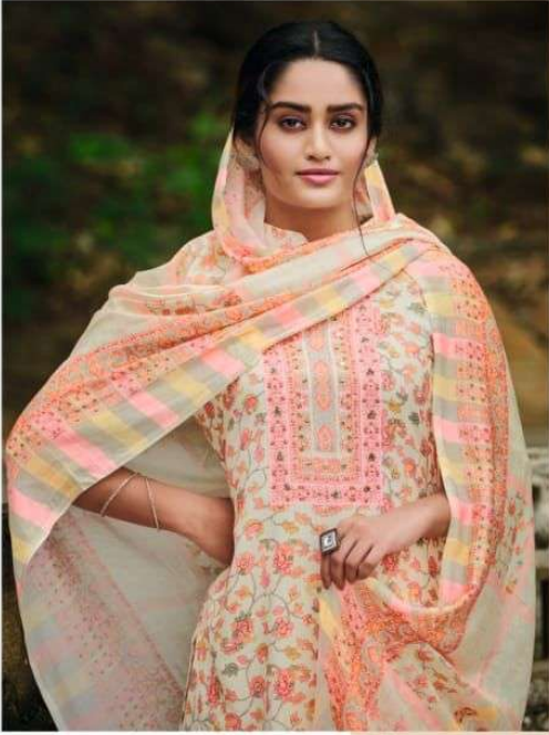
D NO. : 21004