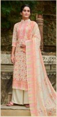
D NO. : 21004