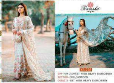
TOP - FOLK CHERNET WITH HEAVY EMBROIDERY BOTTOM - DILLI SANYOON DUPATTA - NET WITH HEAVY EMBROIDERY