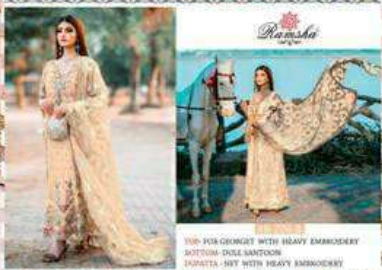
100% FIBER GEORGETTE WITH HEAVY EMBROIDERY BOTTOM: INLE SANITON DUPATTA: NET WITH HEAVY EMBROIDERY