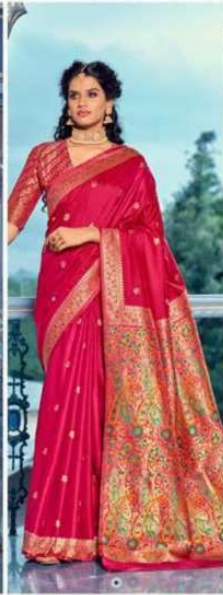
• 6805 •