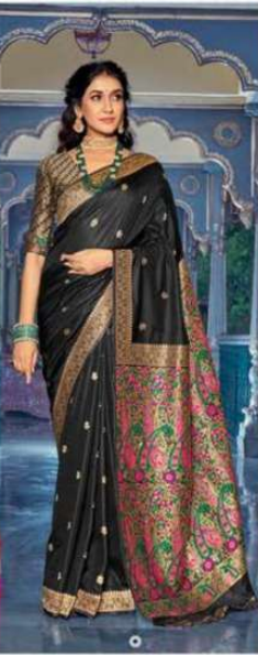
• 6804 •