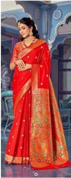
• 6801 •