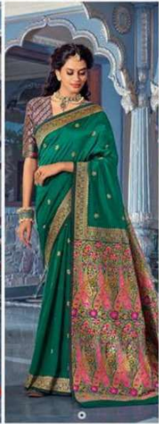
• 6802 •