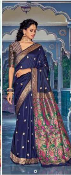
• 6806 •