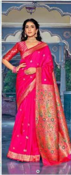
• 6803 •