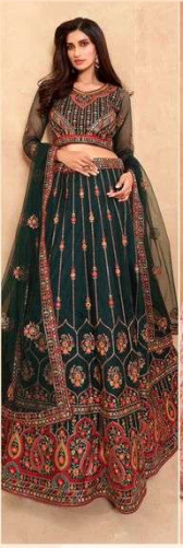
D.No. 1045 ← ୧୧ →