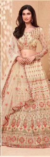
D.No. 1044 ← ୧୩ →