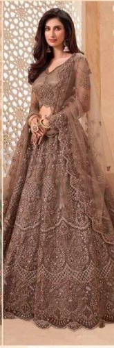
D.No. 1042 ← ୧୧ →