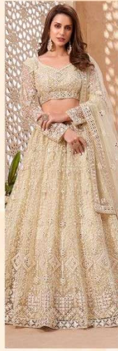
D.No. 1043 ← ୧୧ →