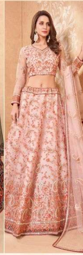
D.No. 1046 ← ୧୧ →