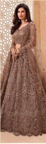
D.No. 1042 ← ୧୩ →