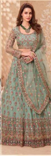
D.No. 1041 ← ୧୧ →