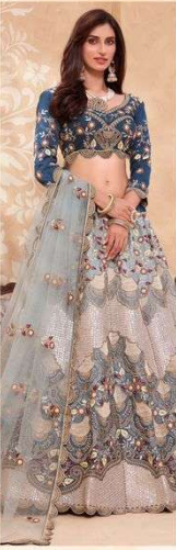
D.No. 1040 ← ୧୧ →