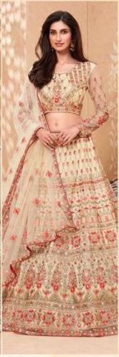
D.No. 1044 ← ୧୧ →