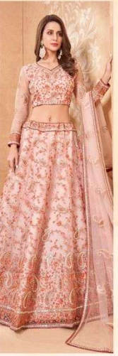
D.No. 1046 ← ୧୧ →