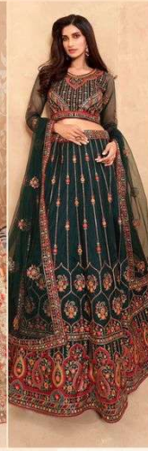
D.No. 1045 ← ୧୧ →