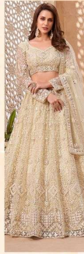
D.No. 1043 ← ୧୧ →