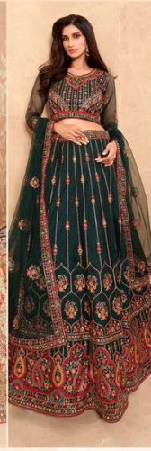
D.No. 1045 ← ୧୩ →