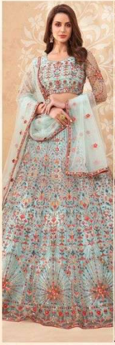
D.No. 1039 ← ୧୧ →