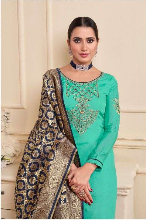
We must never confuse elegance with snobbery.