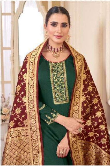
You can have anything you want in life if you dress for it.