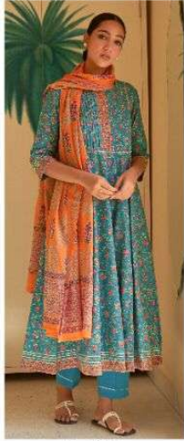
K - 203