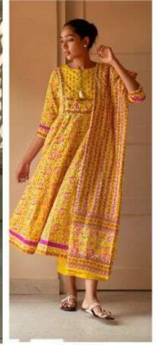
K - 206