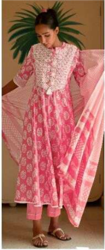
K - 202