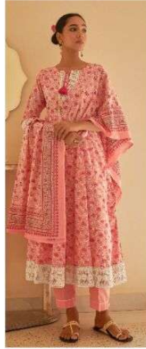
K - 204