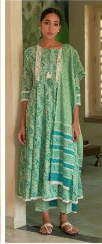
K - 205