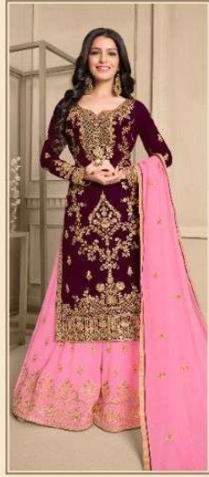
◆ 1910 ◆