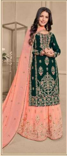
◆ 1909 ◆