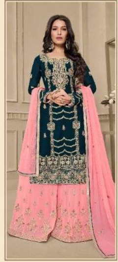
◆ 1912 ◆