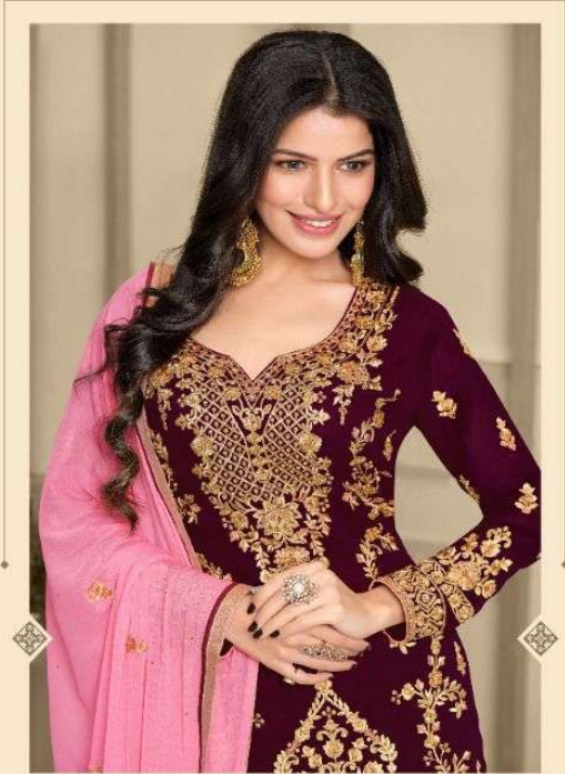
◆ 1910 ◆