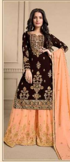
◆ 1911 ◆