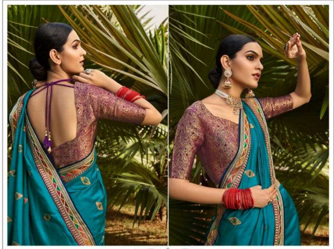
FEROZI BARFI SILK EMBROIDERED SAREE, HAVING EMBROIDERED LACES AND TUSSELS, PAIRED WITH WINE BROCADE BLOUSE