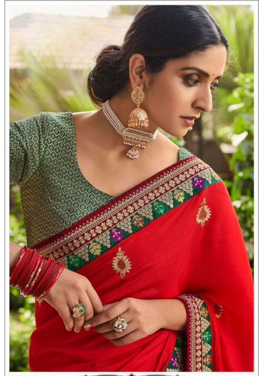
RED BARFI SILK EMBROIDERED SAREE, HAVING EMBROIDERED LACES AND TUSSELS, PAIRED WITH GREEN BROCADE BLOUSE