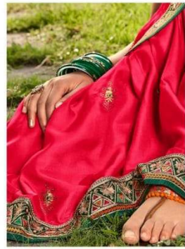
RANI BARFI SILK EMBROIDERED SAREE, HAVING EMBROIDERED LACES AND TUSSELS, PAIRED WITH GREEN BROCADE BLOUSE