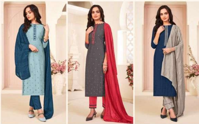
☆ 43007 ☆