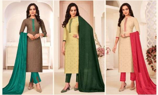
☆ 43004 ☆