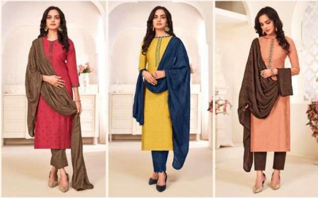
☆ 43001 ☆