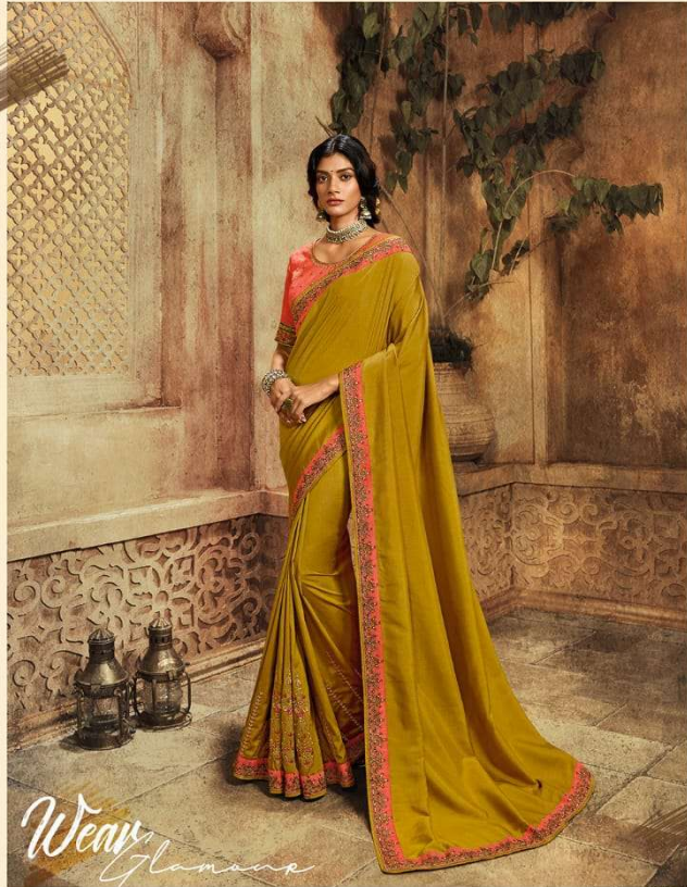
Wear Glamour Motifs are something so delightful as embellish on saree. Alluring drapes with delicate details is a glamorous combination and you will drool your heart out while eyeing this saree collection. || D.no:105 ||