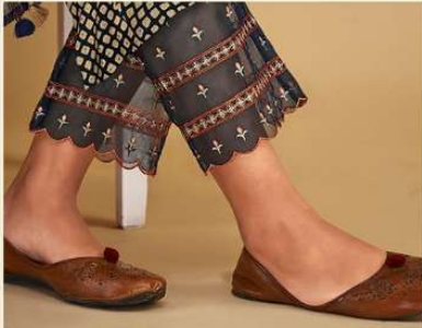
6405 Simplicity is the ultimate FORM OF SOPHISTICATION