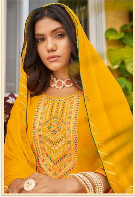
EXCLUSIVE LOOKS designed for the festive fever 3372