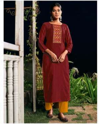
{ 3.3.6.8 }