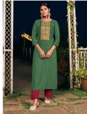
{ 3.3.6.7 }