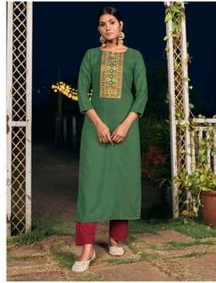
{ 3.3.6.7 }