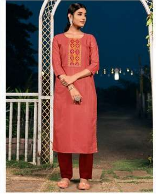
{ 3.3.6.6 }