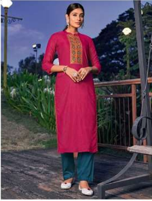
{ 3.3.6.1 }