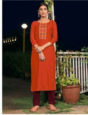
{ 3.3.6.2 }