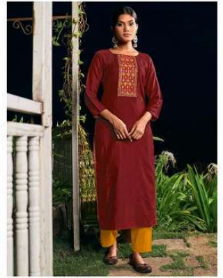
{ 3.3.6.8 }