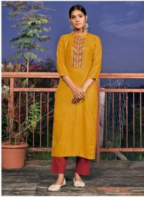
{ 3.3.6.3 }