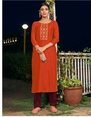
{ 3.3.6.2 }