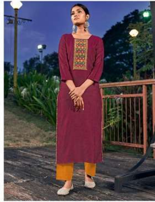
{ 3.3.6.4 }