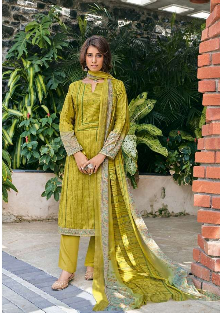
BY THE PATTERNS & VIBRANT COLORS OF POISONOUS YET BEAUTIFUL CREATURES