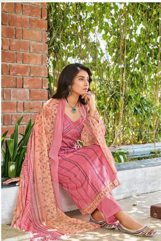
OUR MUSE FOR THIS SEASON IS STRONG, ELEGANT AND NEVER COMPROMISE COMFORT