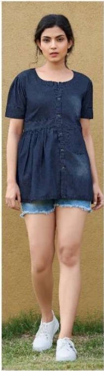
DESIGN - 8002