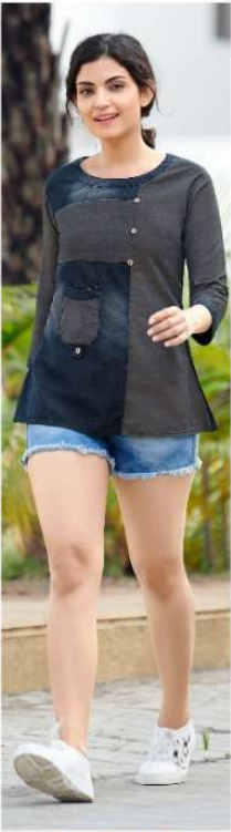
DESIGN - 8001