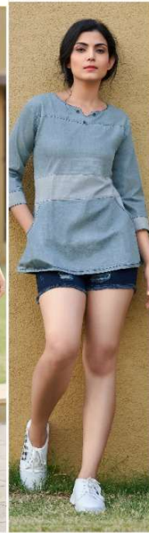
DESIGN - 8005