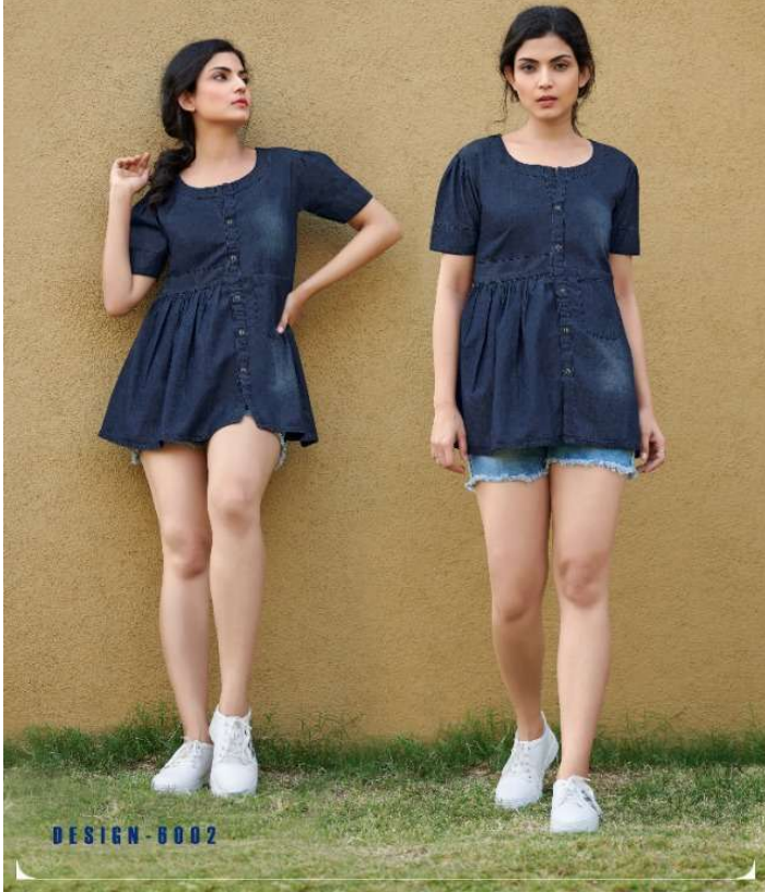
DESIGN - 8002

THE HISTORY OF A DESIGN OR THE OF THE COMMON SENSE. THE DESIGNER HAS TO BE IN THE CAP OF THE FUTURE FOR THE HISTORY OF A DESIGN OR THE OF THE COMMON SENSE. THE DESIGNER HAS TO BE IN THE CAP OF THE FUTURE FOR THE HISTORY OF A DESIGN OR THE OF THE COMMON SENSE. THE DESIGNER HAS TO BE IN THE CAP OF THE FUTURE FOR THE HISTORY OF A DESIGN OR THE OF THE COMMON SENSE. OUT OF THE ORDINARY