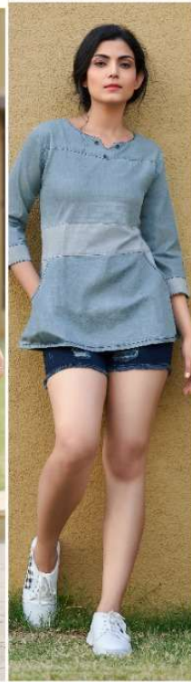
DESIGN - 8005