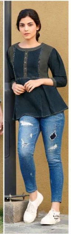
DESIGN - 8006