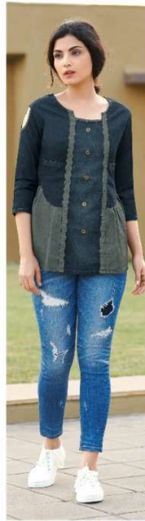
DESIGN - 8004