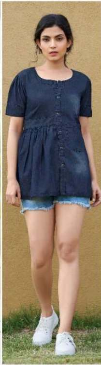
DESIGN - 8002