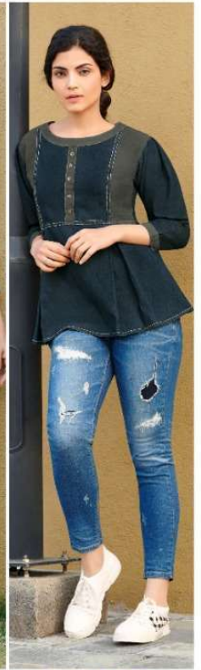
DESIGN - 8006