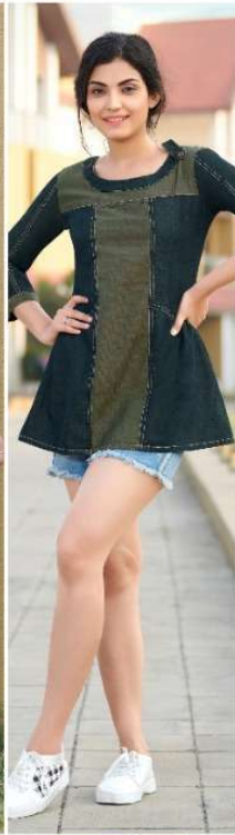
DESIGN - 8003