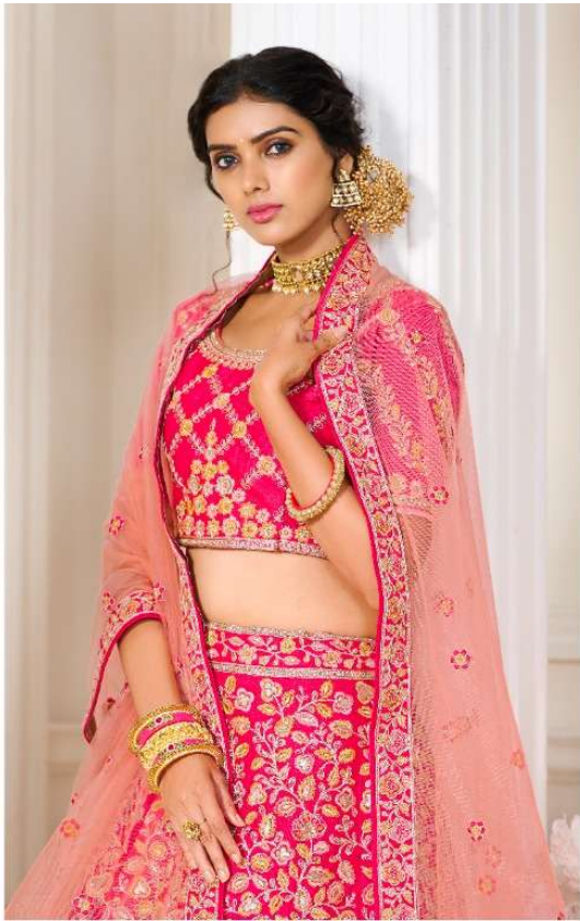
Ethereal collection of traditional outfits spell ethno-chic in myriad ways, making a case for street-inspired and elegant wardrobe choices.