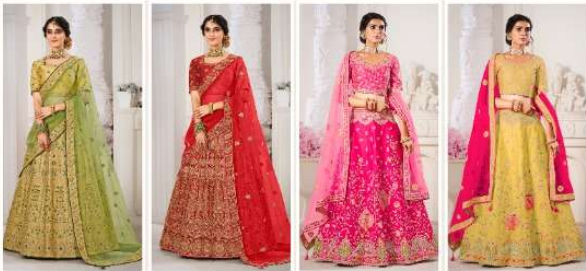
D. NO. : 1101A