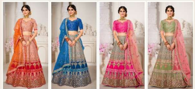
D. NO. : 1108A