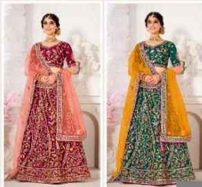
D. NO. : 1104B