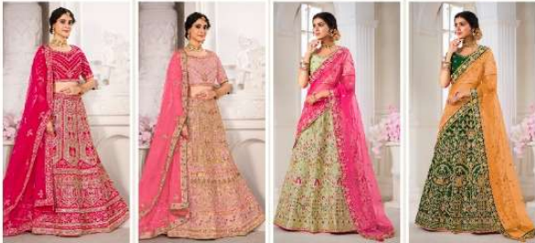
D. NO. : 1103A