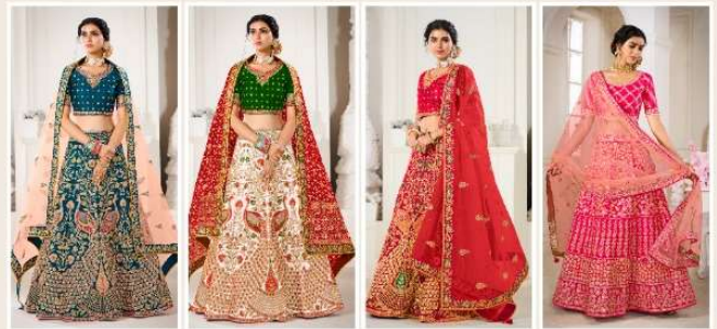
D. NO. : 1106A