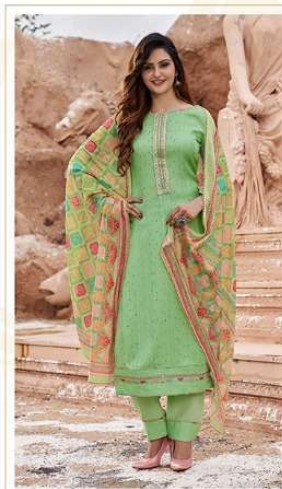
D.No : 3211