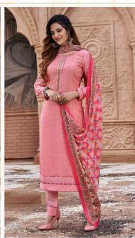
D.No : 3214