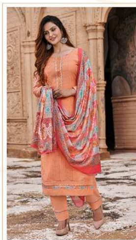
D.No : 3213