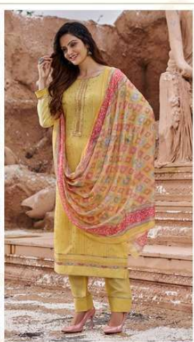
D.No : 3212