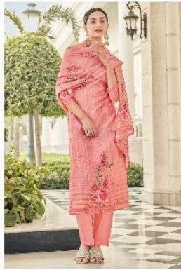
D. NO. 71006