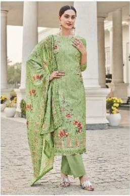
D. NO. 71005