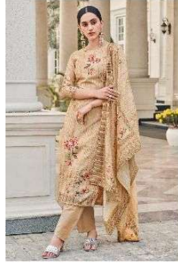
D. NO. 71003