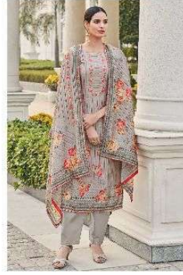
D. NO. 71004