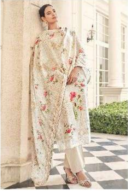
D. NO. 71001