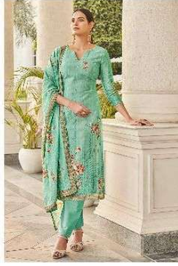
D. NO. 71002