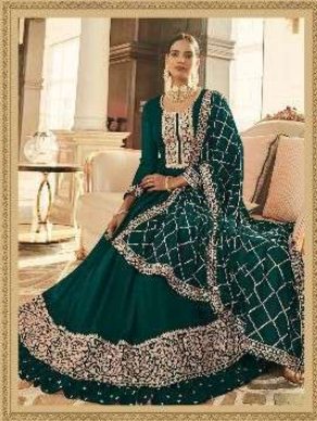
◆ 51000A ◆