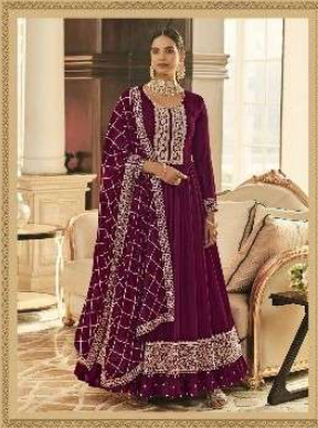
◆ 51000 ◆