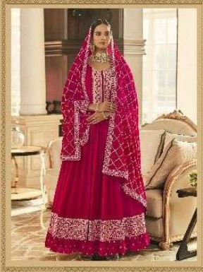
◆ 51000B ◆