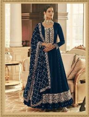
◆ 51000C ◆