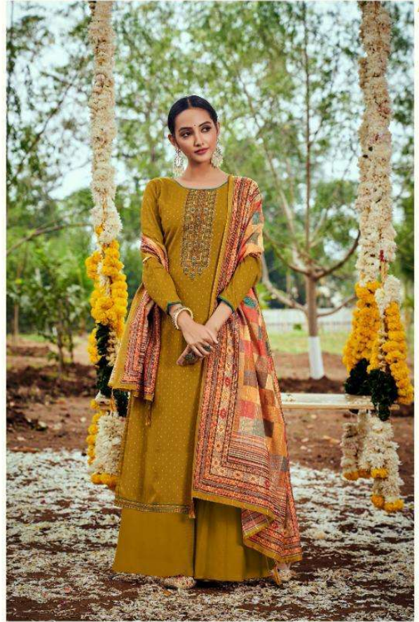
ADD SHINE TO YOUR ETHNIC WARDROBE WITH THIS FABULOUS DESIGN DRESS