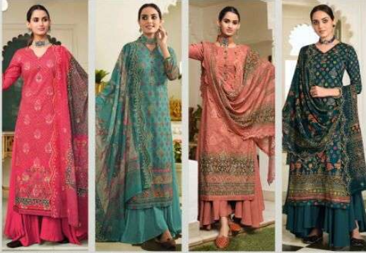
* 5205 * * 5206 * * 5207 * * 5208 *