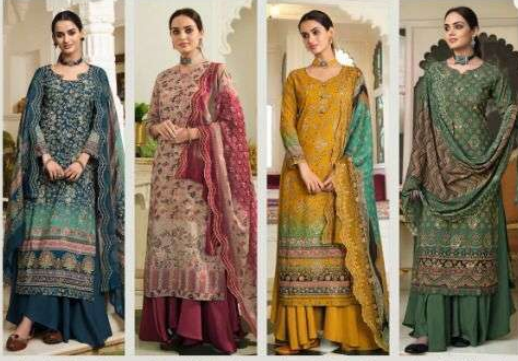
* 5201 * * 5202 * * 5203 * * 5204 *