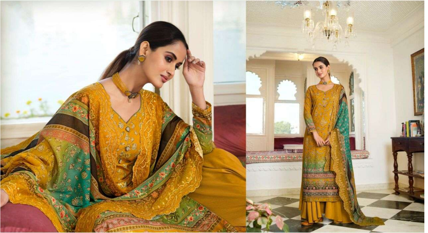
* 5203 *