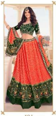
..... 104 .....