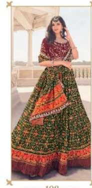
..... 108 .....