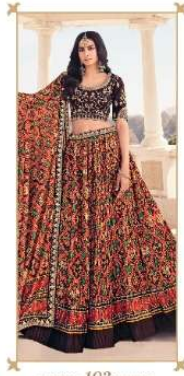
..... 103 .....