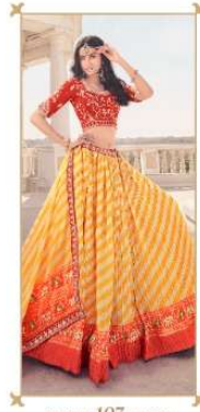
..... 107 .....