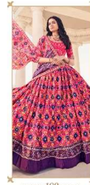
..... 109 .....