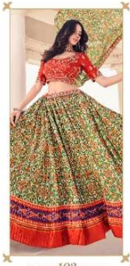
..... 102 .....