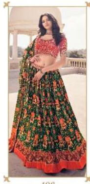
..... 106 .....