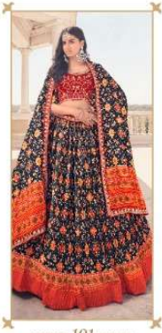
..... 101 .....