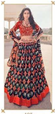
..... 105 .....