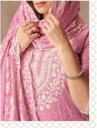
6587 Immerse yourself in unexpected, bright colors & Textures