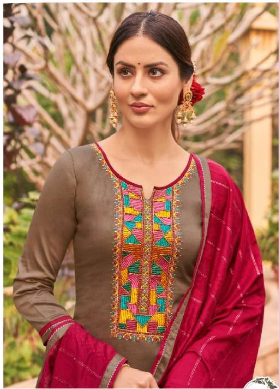
Celebrate the oldest tradition of India