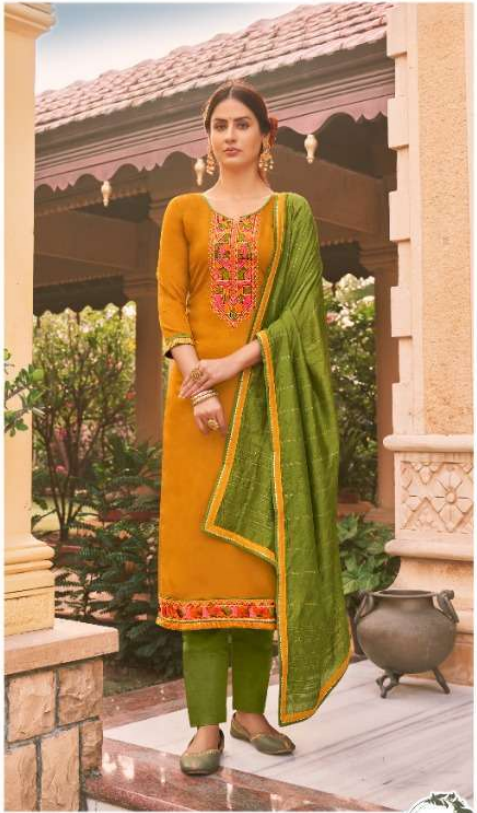
Cherish the magic of adorable shades 11641