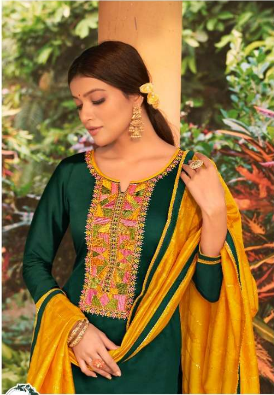
11643 Experience the enchantment of your inner soul