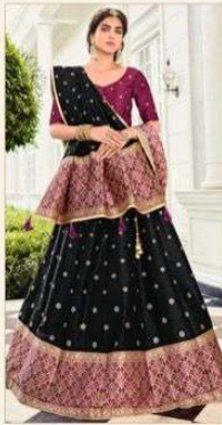
◆ 4277 ◆