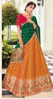
◆ 4272 ◆