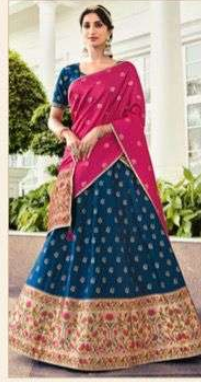
◆ 4273 ◆