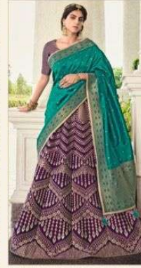
◆ 4274 ◆