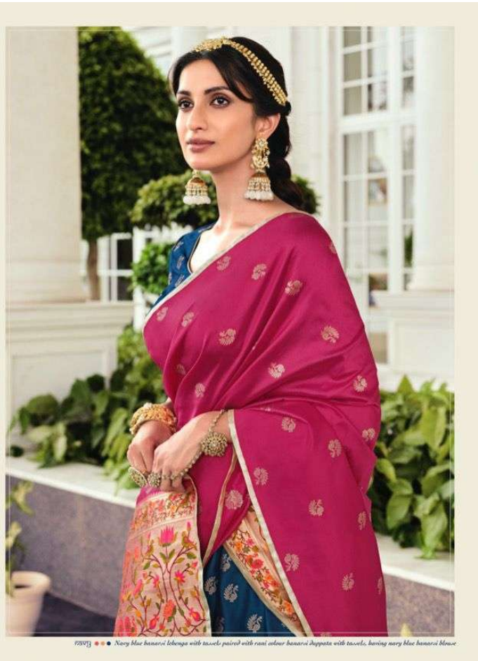
75923 • • • Navy blue banarsi lehenga with tassels paired with royal colour banarsi shoppata with tassels, having navy blue banarsi blouse