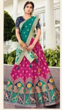
◆ 4275 ◆