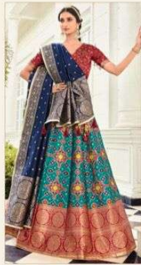
◆ 4278 ◆