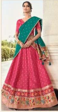
◆ 4271 ◆