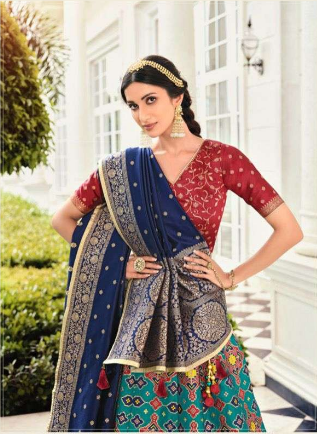
19953 • • • Rama banarasi Lehenga with tassels paired with navy blue colour banarasi dupatta with tassels, having maroon banarasi blouse