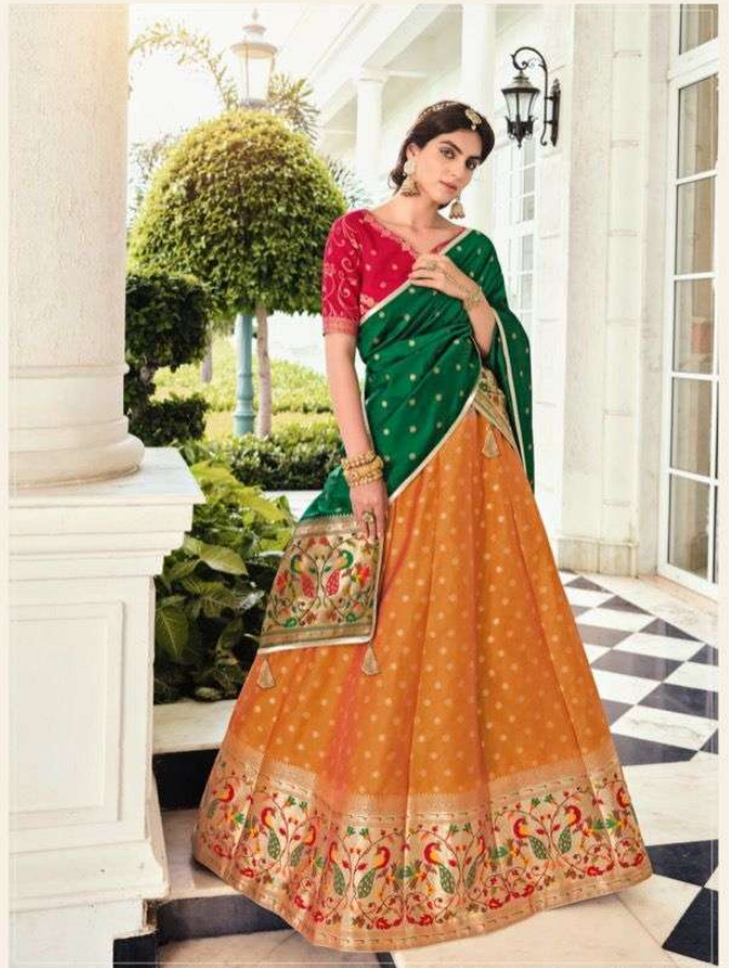
स्वर्णरत्न • • • • Mustard banarsi lehenga with tassels paired with bottle-green colour banarsi dupatta with tassels, having rani banarsi blouse