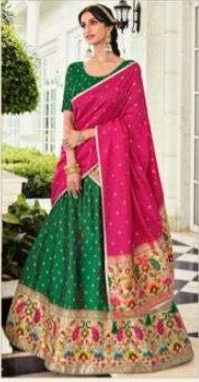
◆ 4270 ◆