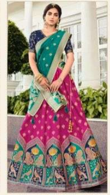
◆ 4275 ◆