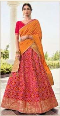
◆ 4276 ◆