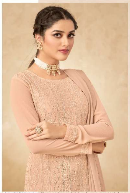
I love black because it affirms, designs, and styles. A woman in a black dress is a pencil stroke.