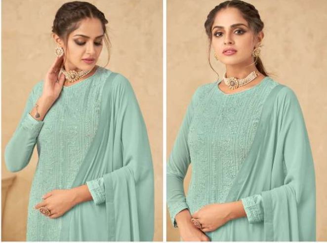
Fashion is not something that exists in dresses only. Fashion is in the sky, in the street. Fashion has to do with ideas, the way we live, what is happening.