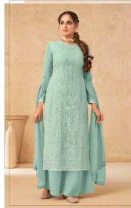
~: 41017 ~: