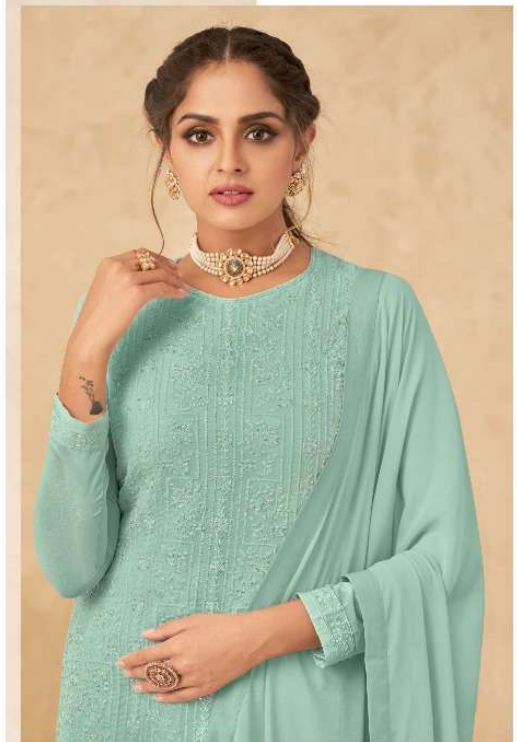
You can wear black at any time. You can wear it at any age. You may wear it for almost any occasion.