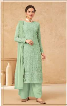
~: 41014 ~: