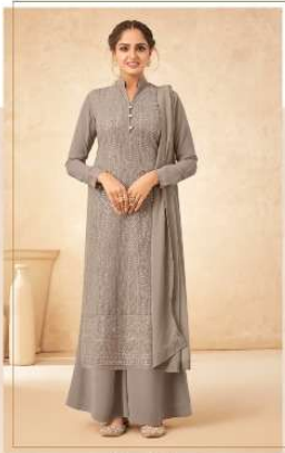
~: 41012 ~: