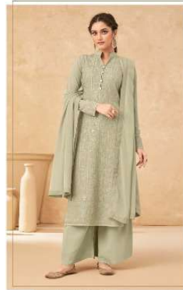
~: 41015 ~: