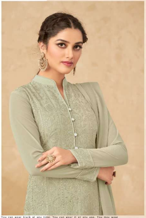
You can wear black at any time. You can wear it at any age. You may wear it for almost any occasion.