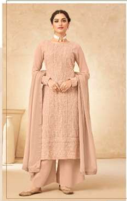
~: 41013 ~: