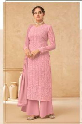
~: 41016 ~: