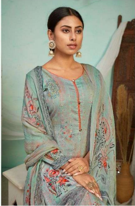
Little wonder then, that this design is the latest rage. 6002