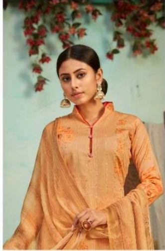
She defines hope for an age that has forgotten how to dream.